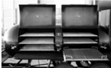
Nearly 46 square feet of cooking area.

Along with all of the other features standard to the TS series smokers, the TS-500 is ready to handle big events for people with big appetites.